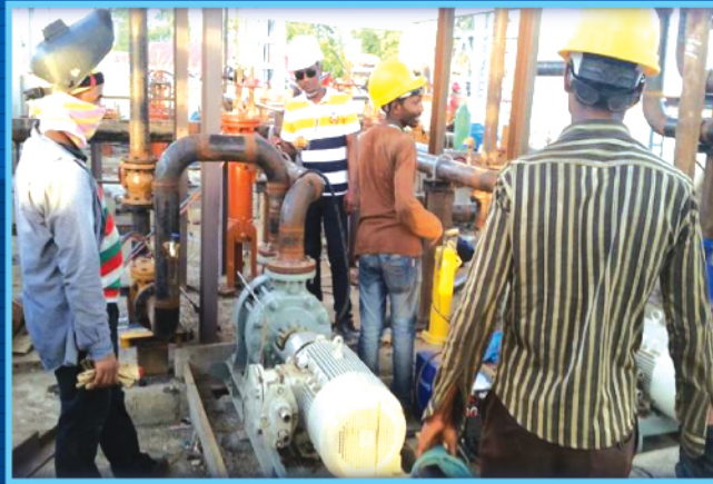
PUMP HOUSE WORKS(FUEL OIL SYSTEM AT POWER PLANT)