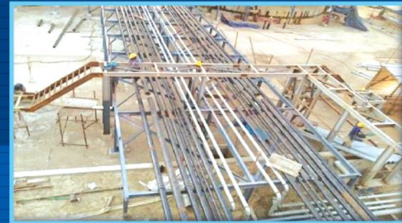
FUEL OIL SYSTEM PIPE LINE WORKS