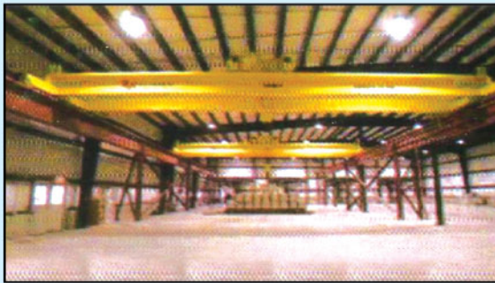
Overhead Crane Fabrication & Erection