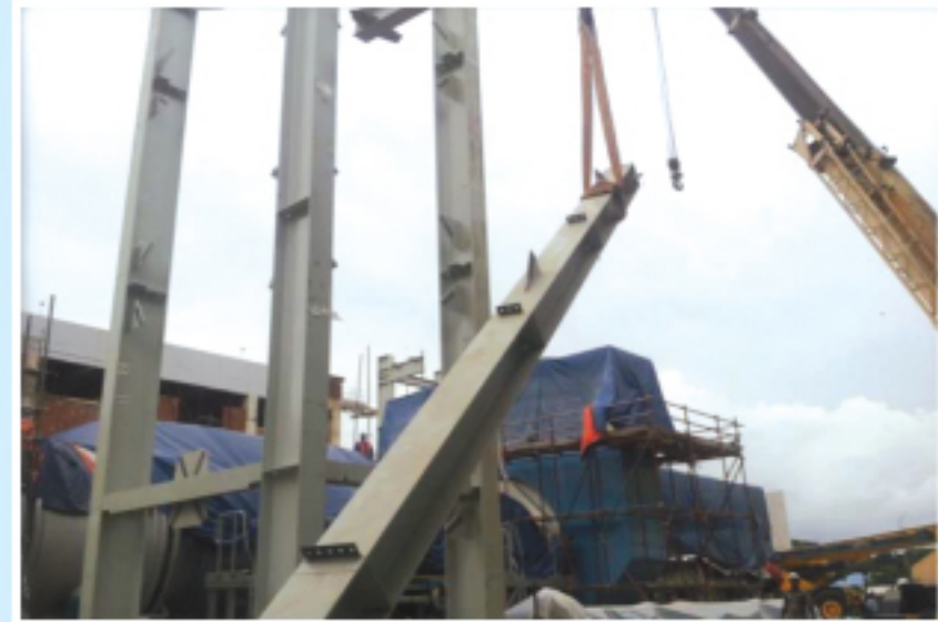
Erection Gas Turbine Enclosure