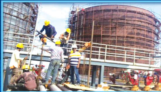
FUEL OIL TRANSFER PIPING AND VALVE WORKS