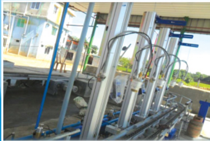
Universal LPG Plant at Fani