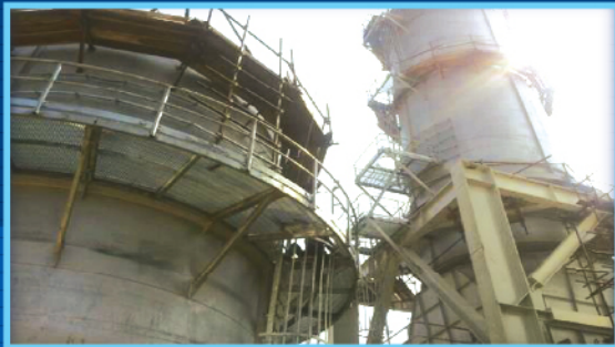
ERECTION WORKS OF BYPASS STACK