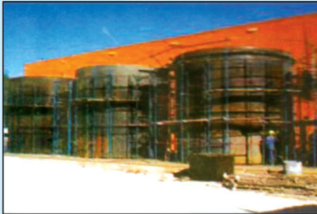
Different Size Of Tank