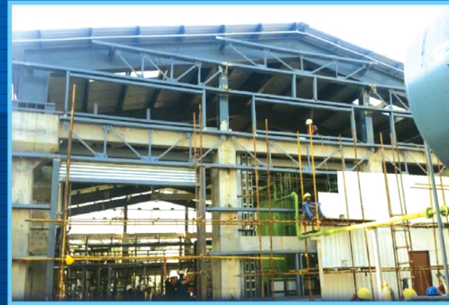
DM PLANT STEEL STRUCTURE WORKS AT POWER PLANT