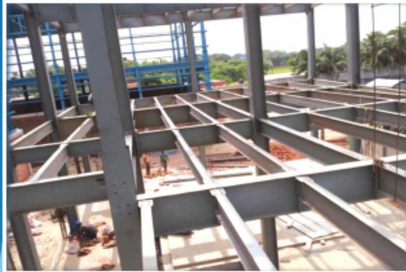
4600 Sft Multi storage utility building Fabrication and Erection