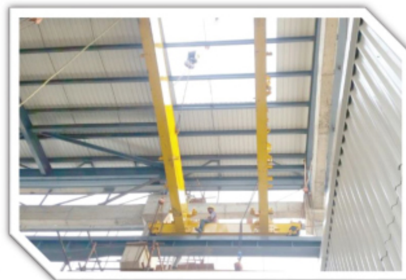
Overhead Crane Erection